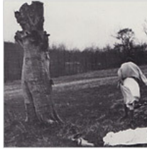
Film of Paul Bowles Short Story Rediscovered