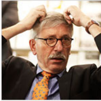
With Words on Muslims, Opening a Door Long Shut