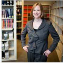
Planning for Taxes in a Time of Uncertainty