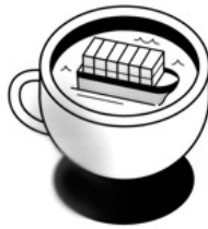
Op-Ed: Throwing Free Trade Overboard