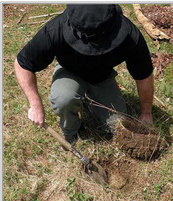
Making a Dakota Fire Hole

This part of the Dakota fire hole will serve as the main chamber that contains the fire. I prefer to extend the base of the fire chamber outward a couple of inches in all directions so that it can accommodate longer pieces of firewood. This saves time and energy in breaking up firewood into suitable lengths, and also has the effect of allowing larger and therefore hotter fires.